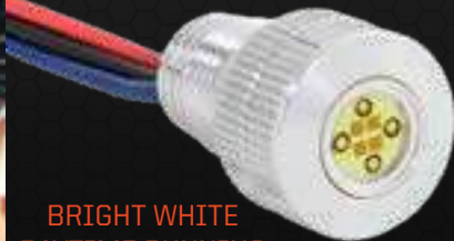
BRIGHT WHITE DAYTIME RUNNING AMBER TURN SIGNALS