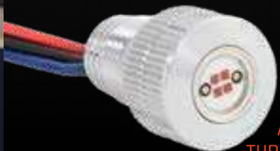
AMBER TURN SIGNALS MARKER LIGHTS