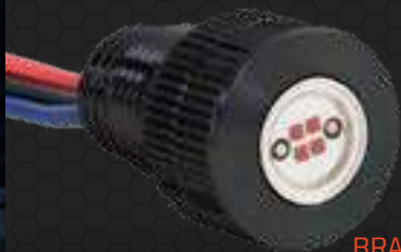
RED BRAKE LIGHTS TAILLIGHTS TURN SIGNALS