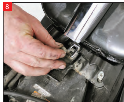
8 Use the stock bolt to attach the lower dash mount to the fuel tank.