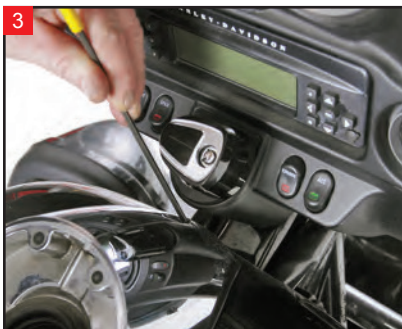
Using an Allen wrench, remove the bolt at the front of the stock dash.