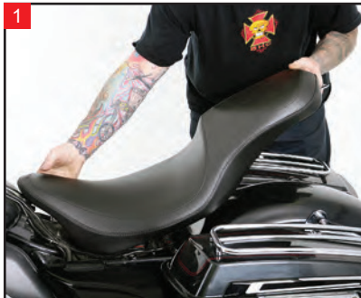
With a Phillips screwdriver, remove the seat bolt and seat.