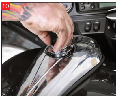
10 Install the included pop up gas cap.