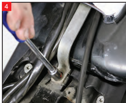
Remove the lower dash bolt with a 3/8" socket.