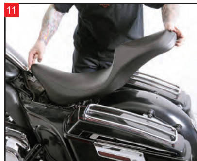
11 Reinstall the seat.