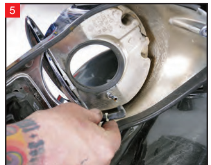
Lift the dash off the fuel tank, flip it over and remove the overflow tube from the underside of the dash.