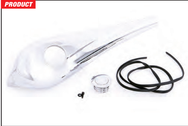
The Clean and Simple Steel Dash, in Chrome. Pop-up gas cap, hardware and trim included.