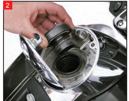
Raise the fuel door and remove the stock gas cap.