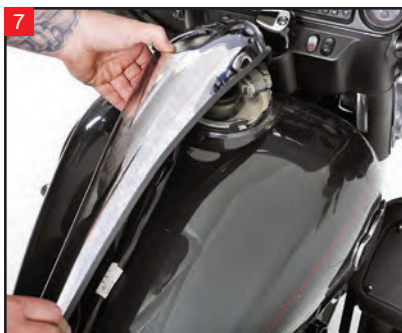
7 Position the dash on the fuel tank. Be sure the vent line and fuel pump wiring are underneath the dash.