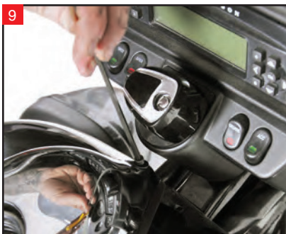
9 With an Allen wrench, use the included bolt and washer for the front dash mount.