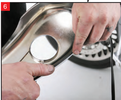
6 Install the included dash trim onto the new Bagger Nation dash. Cut any excess trim that extends past the dash.