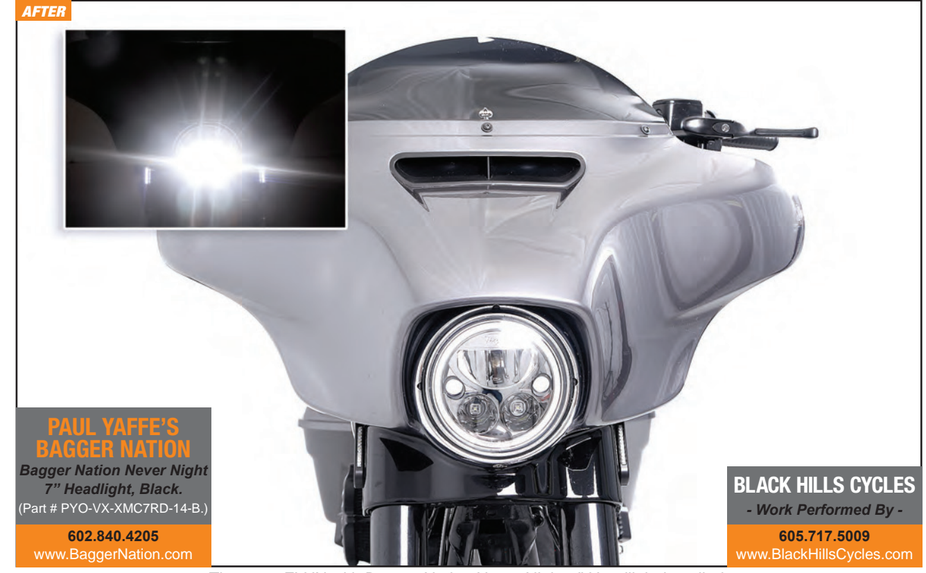
The 2014 FLHX with Bagger Nation Never Night 7" Headlight installed.