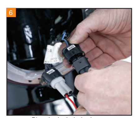
Plug the included adapter harness into the stock wiring.