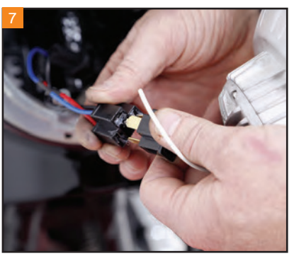
Plug the headlight into the single connector of the adapter harness.