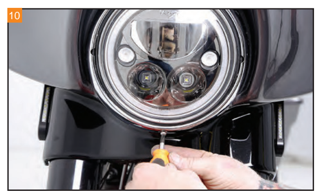
After positioning the trim ring, use a Phillips screwdriver to install the screw at the 6 o'clock position.