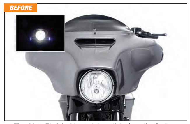
The 2014 FLHX with stock headlight from the factory.