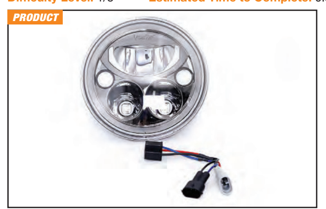
The Bagger Nation 7" Never Night Headlight in Black, with adaptor harness for '14 & later FLH models.

he headlight on your Bagger is a safety feature that not only gives you visibility at night to see where you are heading but it also increases your visibility to be seen by other drivers. Lighting technology has significantly advanced in the last couple of years, which translates into increased safety for everyone on the road. Brighter is better, but there is really much more to it than that. The quality of the lighting emitted from your Bagger's headlight, along with the area it lights up, are important factors as well. Bagger Nation has teamed up with Vision X to offer the new Never Night LED Headlight. Made with a polycarbonate shatterproof lens, the Bagger Nation Never Night LED Headlight is a documented 60% brighter than factory lighting. The light spill is twice as wide and illuminates 400% farther than stock. Bagger Nation carries a Never Night LED Headlight for every model requiring a 7" headlight, as well as 5.75" for Road Glide Models. To see all the products available from Paul Yaffe's Bagger Nation, visit www.BaggerNation.com. Difficulty Level: 1/5 Estimated Time to Complete: 0.5 hours