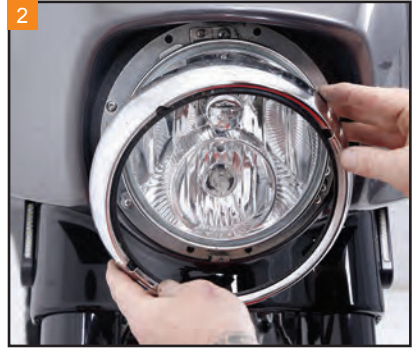
Rotate the trim ring counter-clockwise and remove from the headlight.