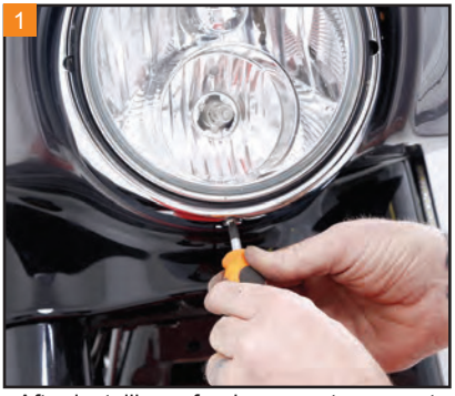
After installing a fender cover to prevent damage, use a Phillips screwdriver to remove the single screw at the bottom of the trim ring.