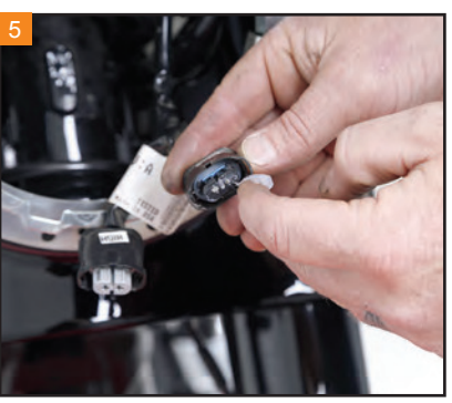
Apply a small amount of dielectric grease to the stock connectors, as well as the connectors on the Bagger Nation wiring adapter.