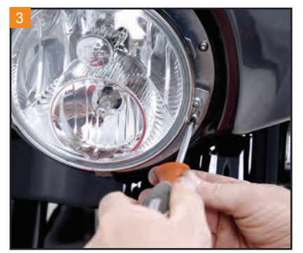
Use a Phillips screwdriver to remove the screws for the retaining ring of the headlight.