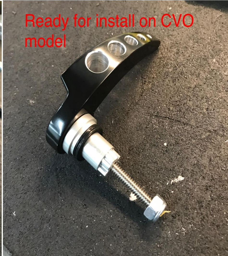
5. Install provided flat head screw into Lid Lifter and secure using OEM nut