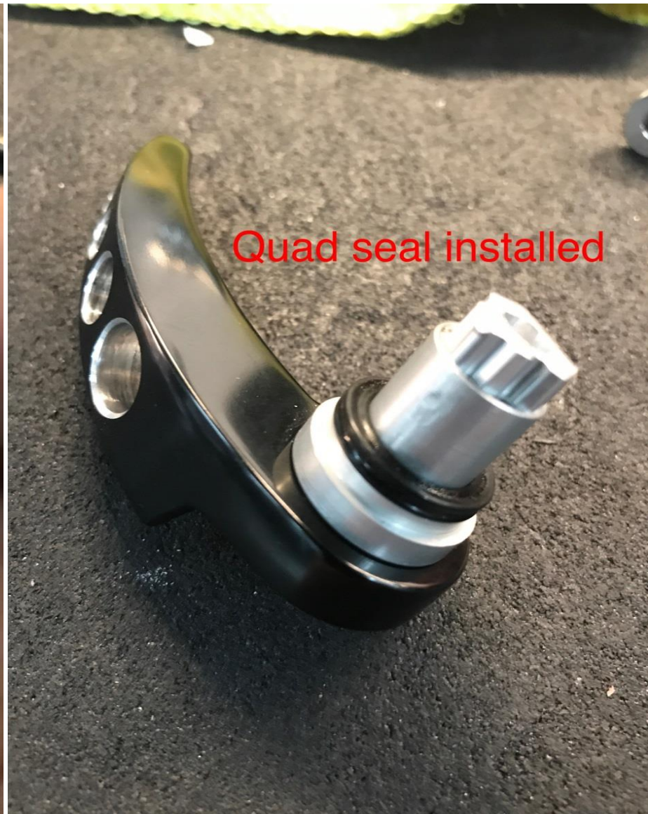
4. Quad seal installed