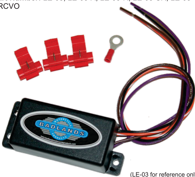
(LE-03 for reference only)

Part Number: LE-03, LE-03-A, LE-03-R, LE-03-SR, LE-03-SRCVO